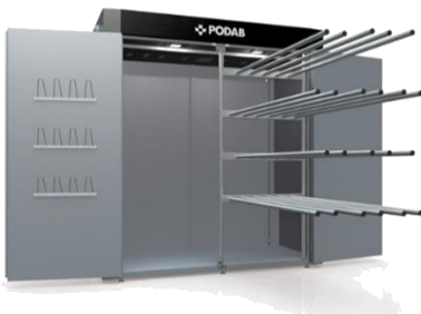
The unique hanging frame (turnable) can be rotated 180° making it easier to handle laundry.