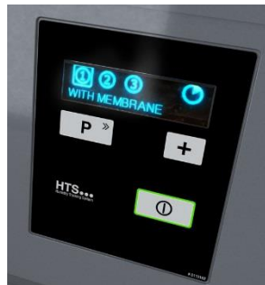
A large electronic control panel displays drying process information.

The TS93 has three temperature levels in manual mode and two automatic programs; cabinet dry and iron dry. The cabinet works with triple fans air-channels which create a perfect balance between evacuated and recirculated air. The removable top panel makes the cabinet easy to install and maintain.